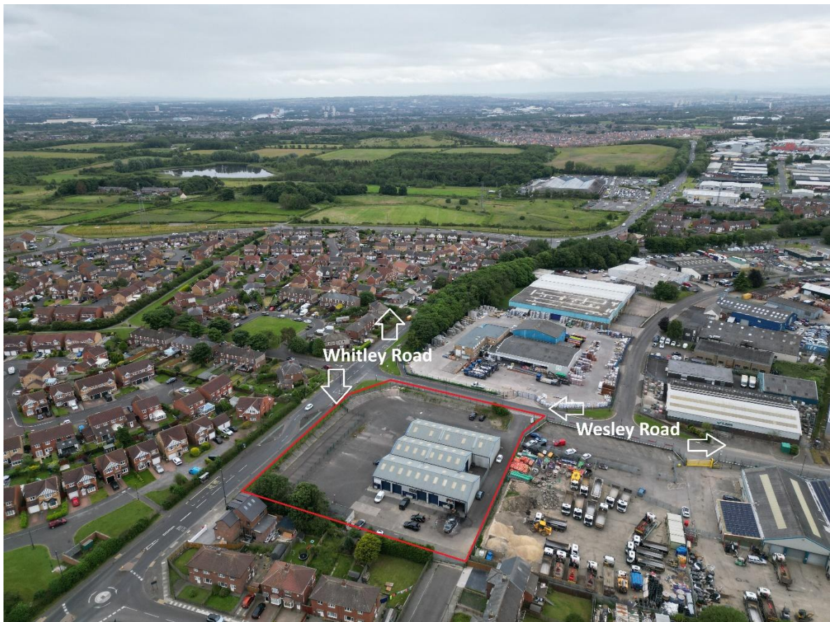
F492 Printed by Ravensworth 01670 713330