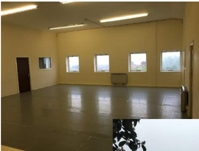
Two Ball Lonnen, Fenham

Ordnance Survey © Crown Copyright 2010. All rights reserved. Licence number 100026549 Commercial use only. Product Scale: 1:12500