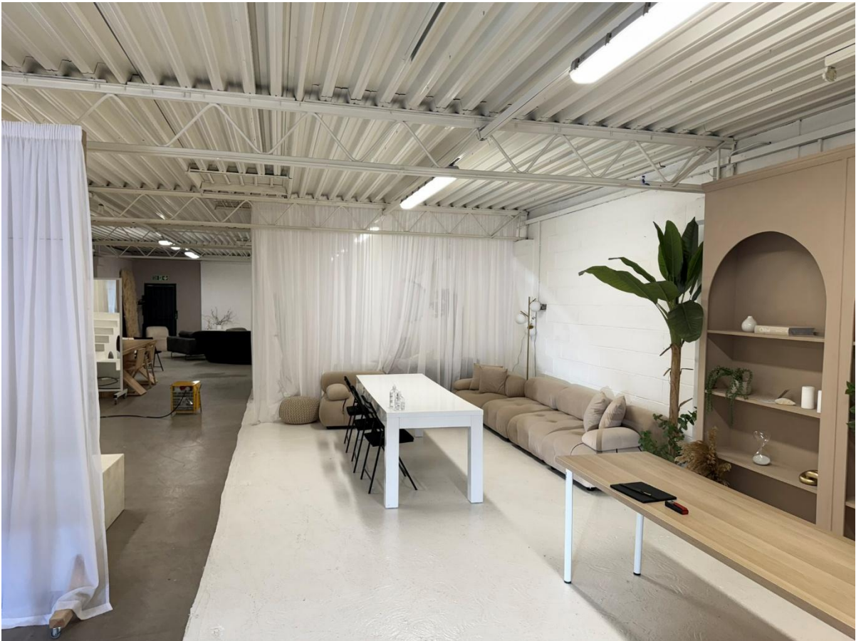
F492 Printed by Ravensworth 01670 713330