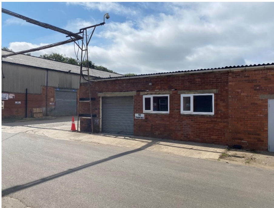
F492 Printed by Ravensworth 01670 713330