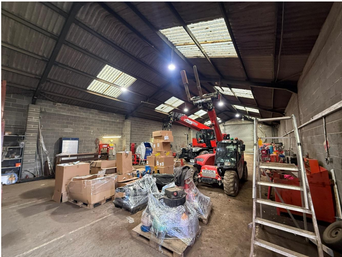
F492 Printed by Ravensworth 01670 713330