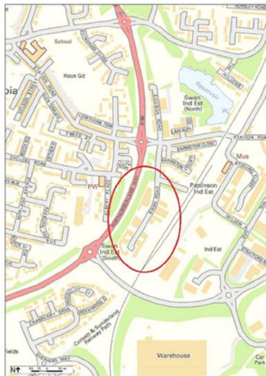
Swan Road, Swan Industrial Estate, Washington, NE38 8JJ

Map Information Scale: 1:5000 Date: 24.02.17 Reference: Order No: 1803254